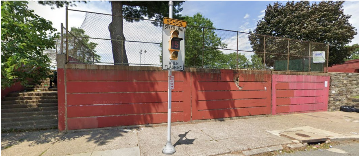
Outdoor wall dimensions: 10ft high x 66ft long