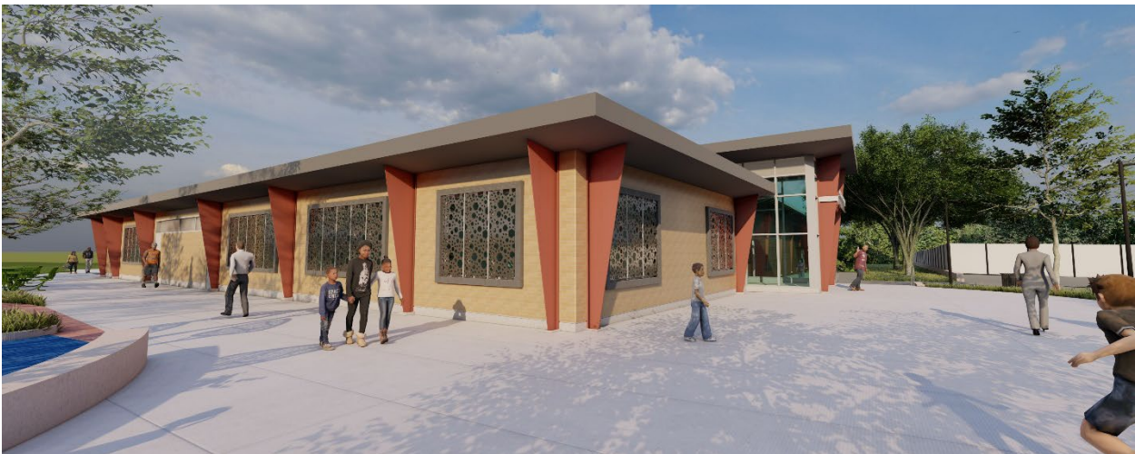
View from southwest entrance of new Olney Recreation Center building. Renderings courtesy of Kelly Maiello Architects. (Note: image shown for context, art wall not shown in this view).