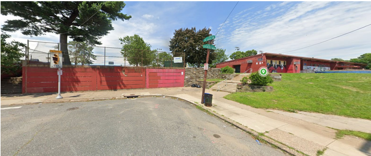
Site photo of exterior Olney Percent for Art wall location (Spencer and A Streets)